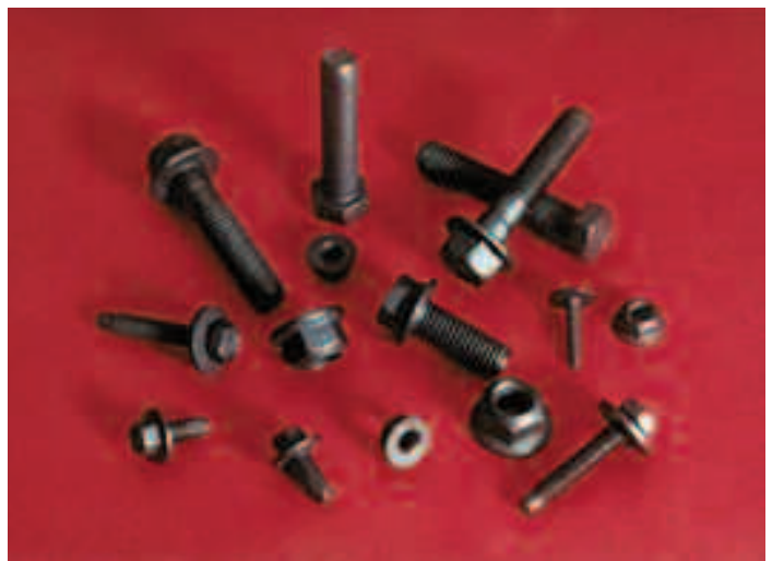
Fasteners coated with Xylan 5420 are environmentally friendly.

Whitford, a privately held company, has manufacturing facilities in 8 countries, offices in 12 more, and agents in an additional 25. Whitford manufactures the largest, most complete line of fluoropolymer coatings in the world. Visit Whitford on the web at: whitfordww.com .