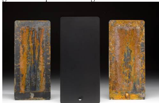
Figure 2. From left to right: C1, Cerakote™ and C2 coated panels following a 385 hour cycle in a 5% salt spray to test for corrosion protection capability. Cerakote™ provides 10 to 25 times more corrosion protection than competitive products.

Each coating was applied to a set of steel panels and in accordance with the manufacturers' directions. Next, the panels were placed in a chamber and continuously exposed to a 5% salt water solution. The panels were checked for corrosion at specific intervals of 45, 160, 255, 385, 675, 850, and 1000 hours. A photo of the panels tested in the salt spray is shown in figure 2. The panels shown in figure 2 were removed from the salt spray at 385 hours in order to depict the variation of corrosion protection provided by each product. At 1000 hours Cerakote™ H-146 was not corroded; however, C1 and C2 completely failed. C1 and C2 experienced corrosion onset at 100 hours and 45 hours, respectively. This study shows that Cerakote™ preserves the life of a firearm 10 to 25 times longer than competitive coatings.